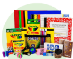
Back to School Essentials

Click on the images below to link to the products.