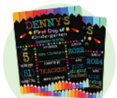
First/Last Day of School Signs