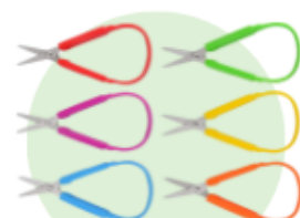
Mini Loop Scissors