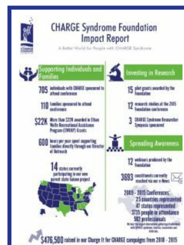
Show the impact their donations are having!